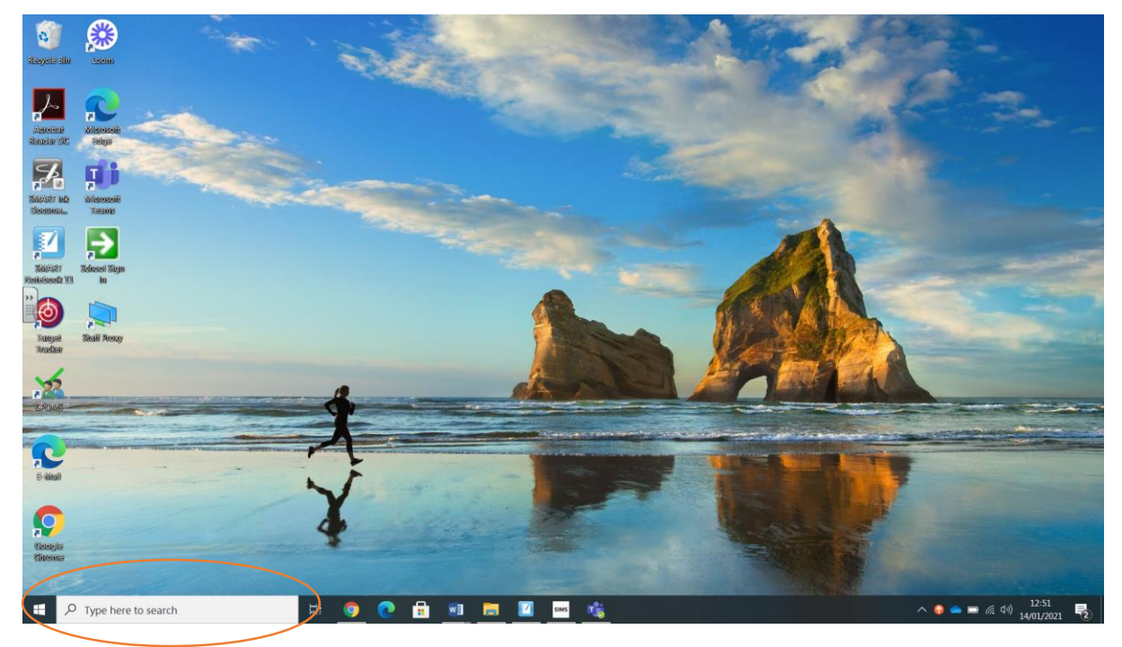
Step 1 – Type 'camera' into the search bar.

Guide to uploading a picture straight to your Laptop / Computer. (Must have a camera / webcam on the device)